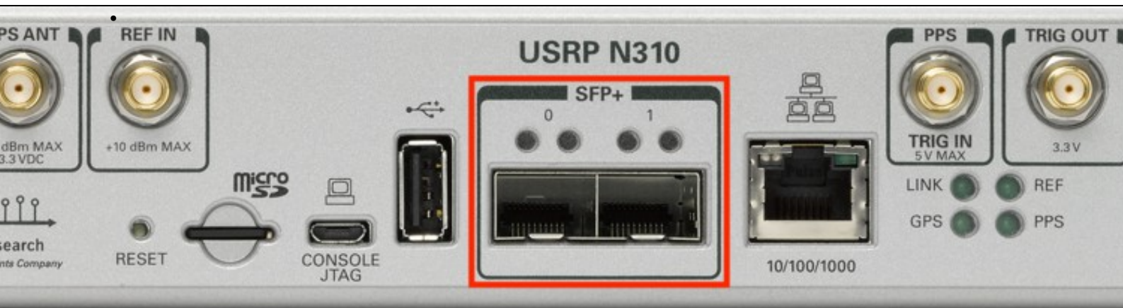
N310 with SFP+ ports emphasized

The N3xx has a pair of SFP+ ports located on the rear panel of the device. These interfaces are labeled 0 and 1: