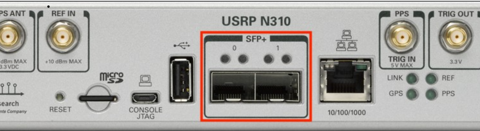
N310 with SFP+ ports emphasized

The N3xx has a pair of SFP+ ports located on the rear panel of the device. These interfaces are labeled 0 and 1: