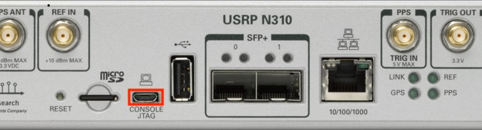
Figure 1: N310 Rear Panel with serial port emphasized.

N3xx devices all have an serial console port intended for communications with the ARM or the SMT32 MCU. This interface is suitable for remote device access and MCU log monitoring.