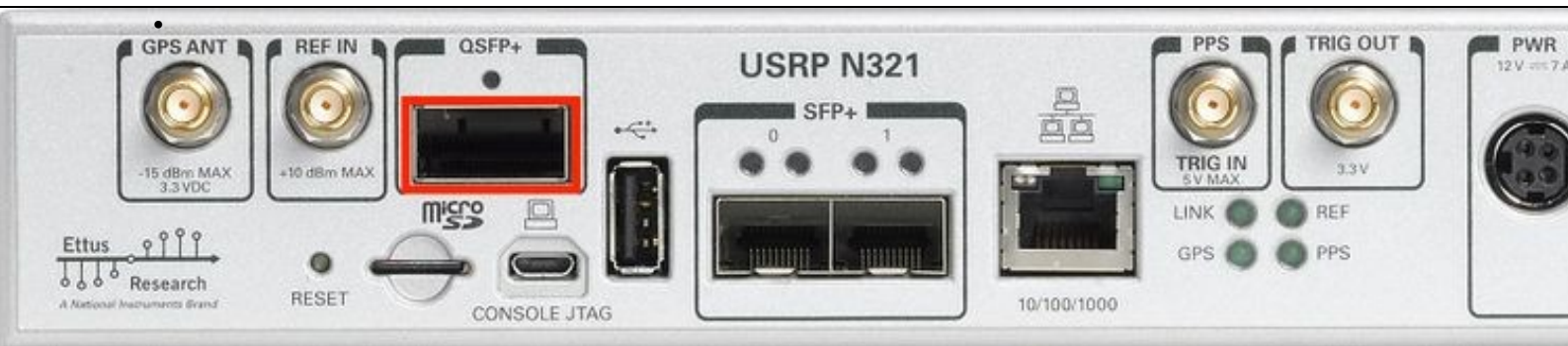
Figure 1: N310 Rear Panel with serial port emphasized.

The N320 and N321 devices are equipped with a QSFP+ port: