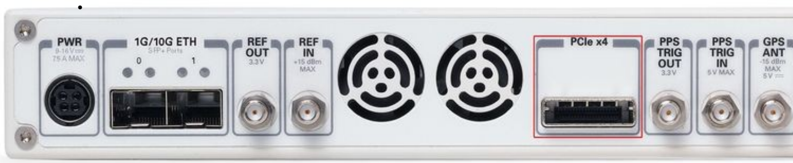
Figure 5: X310 Rear Panel with PCIe port emphasized.

The X310 has a PCIe x4 located on the rear panel of the device near the power input. This interface is labeled PCIe x4 (also referred to as a MXI connection when used with a PXI system)