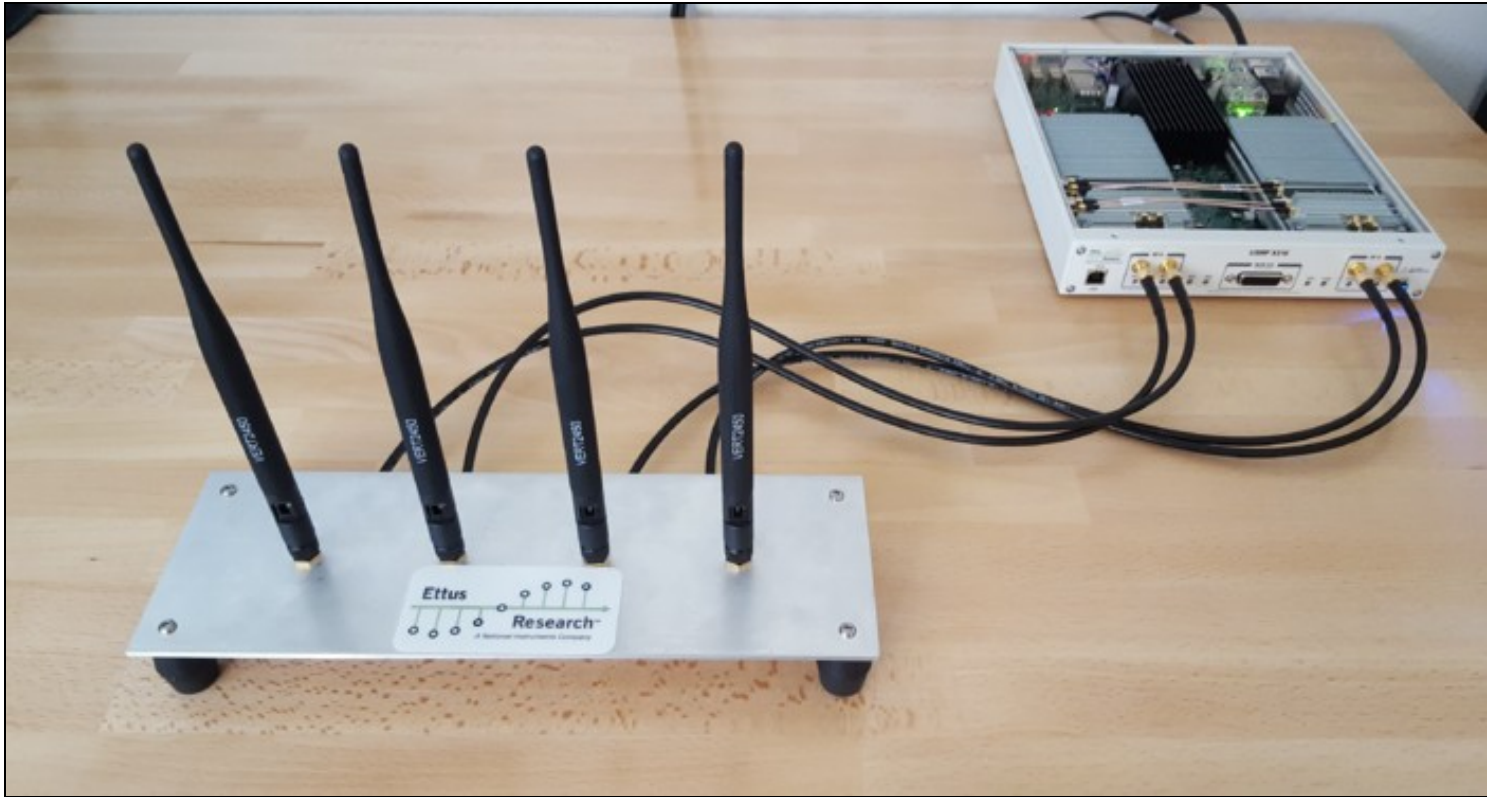
Figure 2: Example linear array

IMPORTANT: It is strongly recommended that the antenna element separation is half-wavelength or lower depending on the tone center-frequency. Arranging antenna elements at larger distances leads to an aliasing effect and compromises the angle resolution capability of the DoA algorithms. The detailed list of steps for DoA demonstration are as follows: