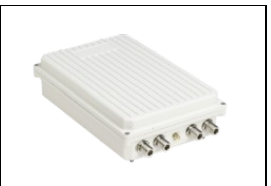
The USRP E313 is a fully assembled device that includes an USRP E310.

Make sure that your kit contains all the items listed above. If any items are missing, please contact your sales agent or Ettus Research Technical support immediately.