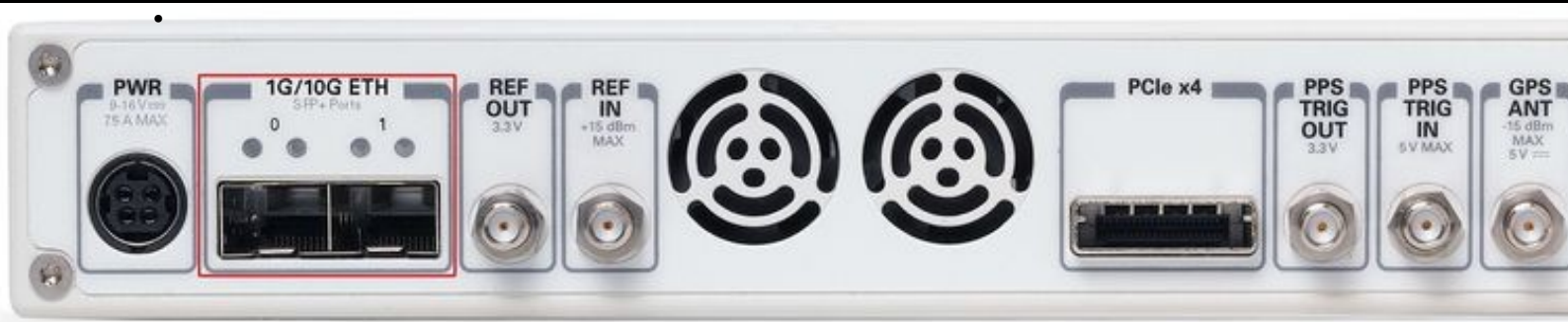
Figure 1: X310 Rear Panel with SFP+ ports emphasized.

The X310 has a pair of SFP+ ports located on the rear panel of the device near the power input. These interfaces are labeled 0 and 1: