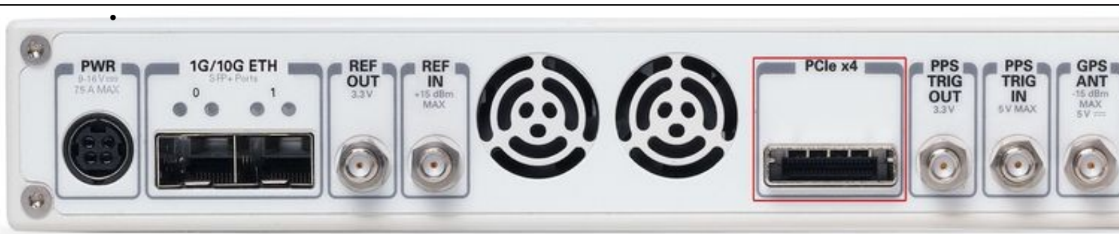
Figure 5: X310 Rear Panel with PCIe port emphasized.

The X310 has a PCIe x4 located on the rear panel of the device near the power input. This interface is labeled PCIe x4 (also referred to as a MXI connection when used with a PXI system)