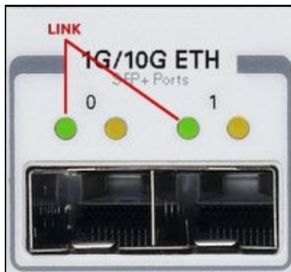
Figure 2: X310 SFP+ ports with link and data LEDs.

This protocol is supported only on X3xx SFP+ port 0 when using the HG FPGA image. If both of these conditions are met, you will see the green LINK LED illuminate when a working SFP+ adapter is inserted into the powered-on X310. On X3xx devices, this LED should light up regardless of successful connection to host when a working SFP+ adapter is inserted.